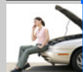
24 hr. Assistance

* Select Eurocars is proud to offer our customers a Security Platinum plan on all vehicle purchases. Full program description is available for Motor Club plus Involuntary Unemployment Protection Benefits.